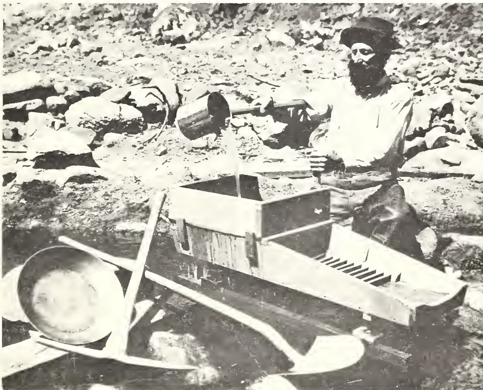
Figure 1. A nineteenth-century miner working a placer claim somewhere in the Applegate River drainage; the use of the "rocker-box" was typical of much early mining.

Primary sources dealing with the lifestyle of the early miners of southwest Oregon are rare. This is especially true for the Orientals, Hawaiians and other minorities. Protection of the area's early mining sites is important for several reasons. Once numerous, they are now quite rare. Archaeological investigation of some of these sites may be able to increase our understanding of the "pioneer" era. Finally, they have intrinsic value as the only remaining evidence of the first phase of non-Indian occupation. Sites falling into the early mining category have high significance as cultural resources.